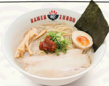
Tonkotsu Red $21 Pork Broth Chilli Paste