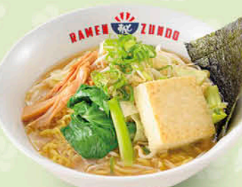
Vegetarian Miso $20