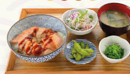
Teriyaki Salmon Don $26