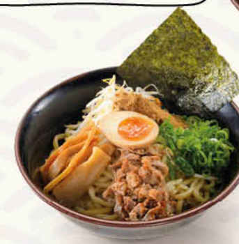
Abura-Soba Gyokai $22 Dried Bonito Blend