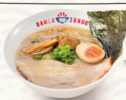
Gyokai Tonkotsu $21.50 Pork Broth Dried Bonito Blend