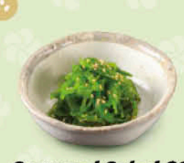
Seaweed Salad $6