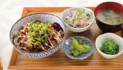
Pork Chashu Don $21