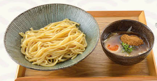
Tsukemen Gyokai $22.50 Dried Bonito Blend