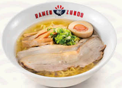
Shio $19.50 Chicken & Pork Broth Salt Base