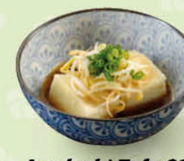
Agedashi Tofu $8