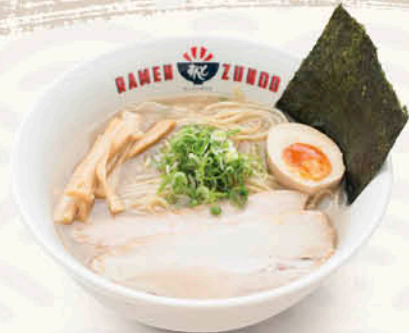
Tonkotsu Original $20 Pork Broth

Traces of these allergens may be contained in food that does not show the allergen indicator in its description. Ramen Zundo takes the utmost care in food handling, but please, proceed with caution when affected by a severe allergy.