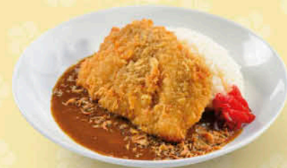
Chicken Katsu Curry $20