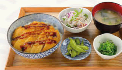
Chicken Katsu Don $21 Chicken Schnitzel (Breast Fillet)