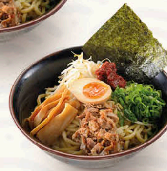
Abura-Soba Spicy $21.50 Original Spicy Paste