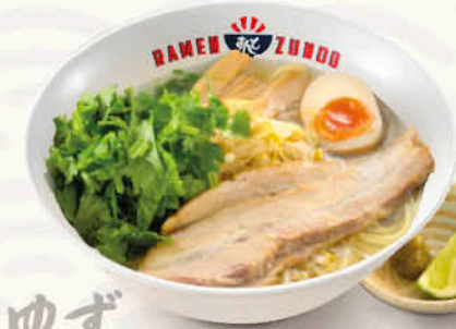
Yuzu Shio Coriander $24 Chicken & Pork Broth Yuzu Citrus