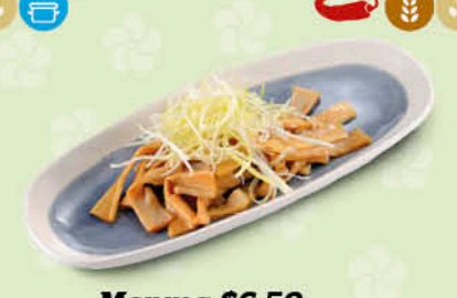
Menma $6.50 Bamboo Shoots with Garlic Leak