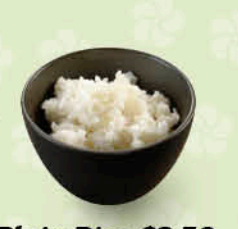
Plain Rice $3.50