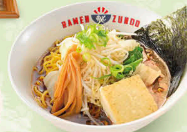
Vegetarian Soy $19.50