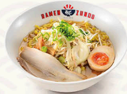
Miso $21.50 Chicken & Pork Broth with Soy Bean Paste