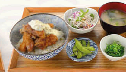
Chicken Karaage Tartare Don $22.50 Deep Fried Chicken Thigh with Tartare Sauce