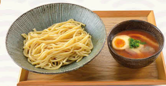
Spicy Tsukemen $22