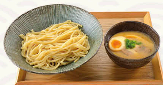
Tsukemen Original $21

Homemade thick dipping noodles. Dipping soup extracted from chicken, pork and vegetable.