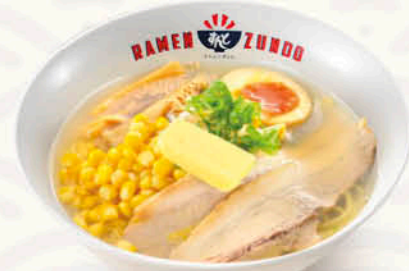
BUTTER CORN: Shio $22, Miso $24 Chicken & Pork Broth