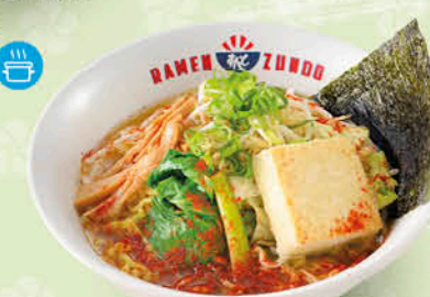
Vegetarian Miso Spicy $20.50