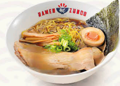
Soy $19.50 Chicken & Pork Broth Soy Sauce Base