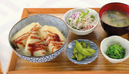
Teriyaki Tofu Don $21