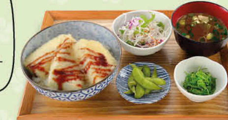
Vegetarian Teriyaki Tofu Don $21

Noodles are free from animal derived products. However, is cooked in the same cooker as normal noodles containing eggs. Tofu fried in separate vegetarian-only fryer.