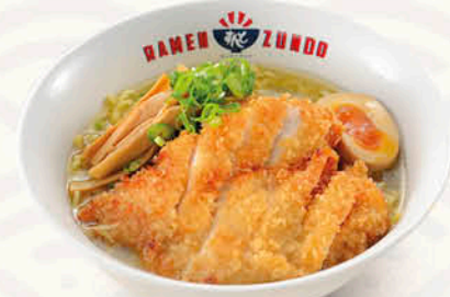
CHICKEN KATSU: Tonkotsu $26.50 Shio / Soy $26 Miso $28 Chicken Schnitzel (Breast Fillet)