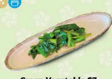
Green Vegetable $7