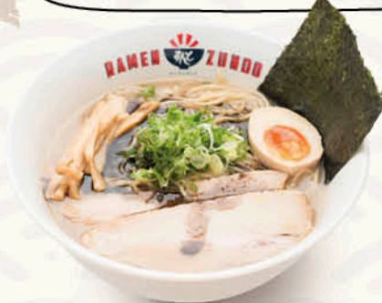
Tonkotsu Black $21 Pork Broth Roasted Garlic Oil