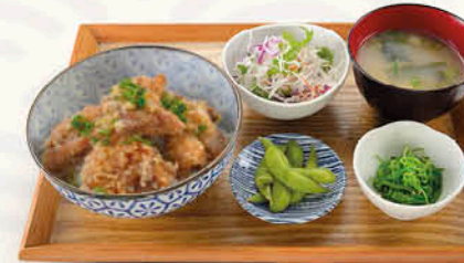
Chicken Karaage Don $21 Deep Fried Chicken (Thigh Fillet)