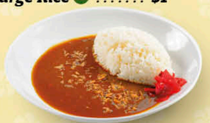
Plain Curry Rice $15