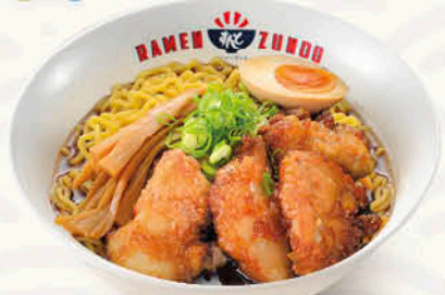
CHICKEN KARAAGE: Tonkotsu $26.50 Shio / Soy $26 Miso $28 Deep Fried Chicken (Thigh Fillet)