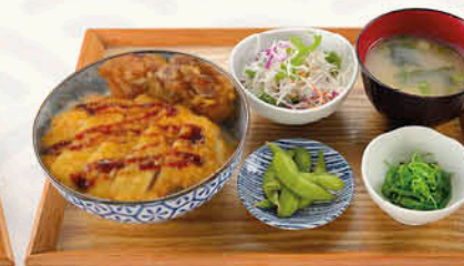
Chicken Katsu Karaage Don $23.50 Chicken Schnitzel & Deep Fried Chicken