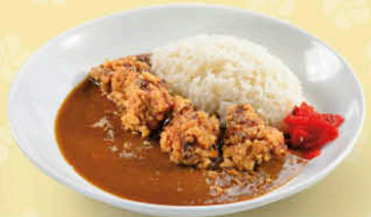
Karaage Curry $20