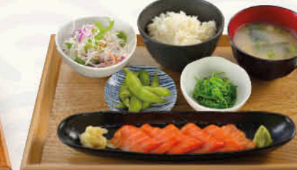
Salmon Sashimi Set $26

Noodles are free from animal derived products. However, is cooked in the same cooker as normal noodles containing eggs. Tofu fried in separate vegetarian-only fryer.