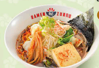
Vegetarian Soy Spicy $20